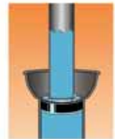
Stand Pipe Model